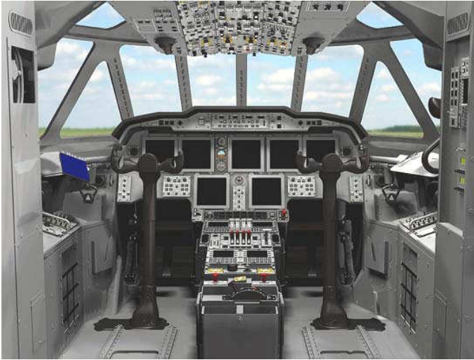
Computer generated image of the Nimrod MRA4 flight deck simulator

history of the British aircraft industry and, in particular, the role played by the Woodford complex; was described and illustrated with