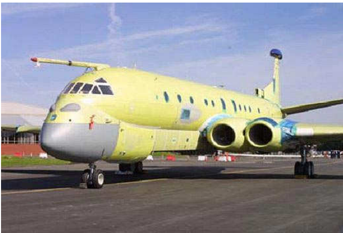
Nimrod MRA4

July 10th - Our chosen summer outing was to BAE Systems at Woodford and sixteen people attended, some of whom wished to revisit the site to be re-acquainted with the experience.